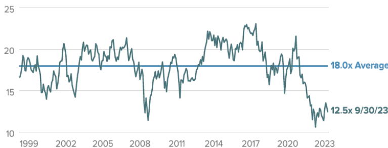
Exhibit 3: Relative Small Cap Valuations 5